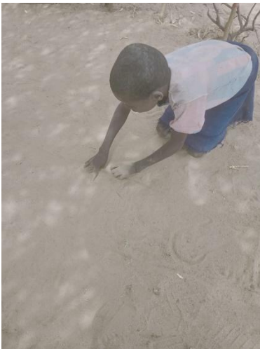
Learners write on the ground