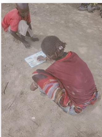
INES Partner based