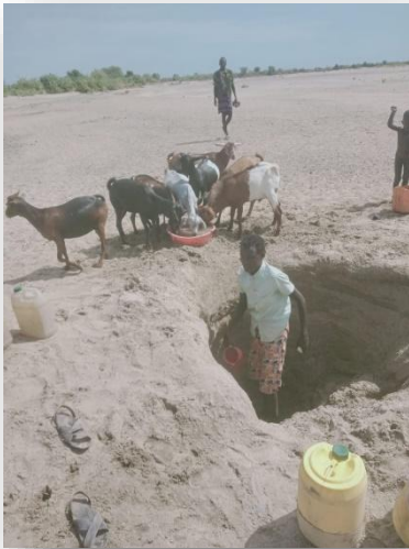
Duties after schooling