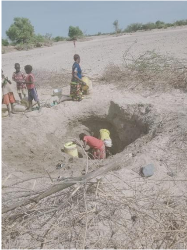
Young girls after INES class 1