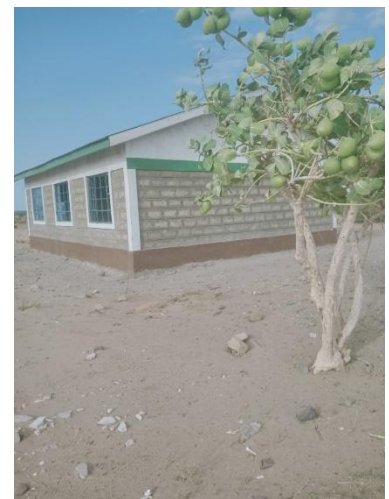
Abandoned government school