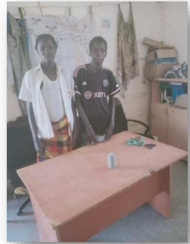
Asking for teaching position