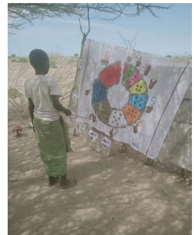
Teacher in Class