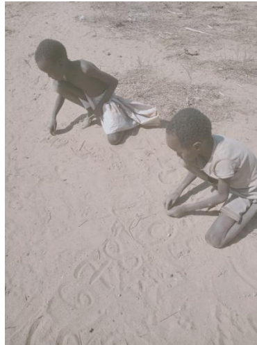
Learners write on the ground