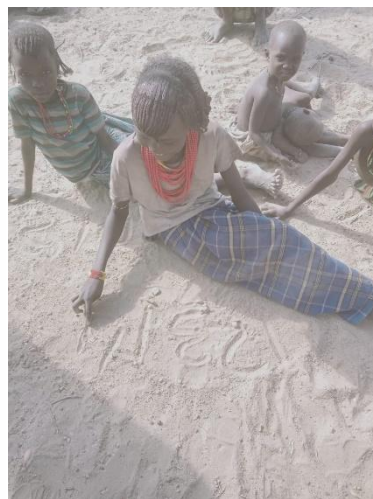
Writing on the ground during school