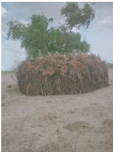
INES Fora School